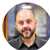
Octavi de la Varga Metropolis Secretary General

Through case studies from the members that we share with the 100 Resilient Cities network, this paper seeks to analyze the challenges and opportunities of metropolitan-scale planning, and its role in catalyzing resilience objectives. These examples show how the governance structures and collaborations that arose across metropolitan areas tackle the shocks and stresses experienced by cities. We hope, therefore, to contribute to the understanding that all cities, big or small, have to look beyond their administrative borders when addressing their resilience challenges.